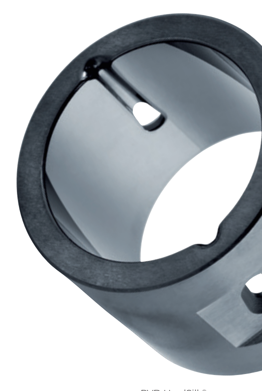
» PVD HardSilk®